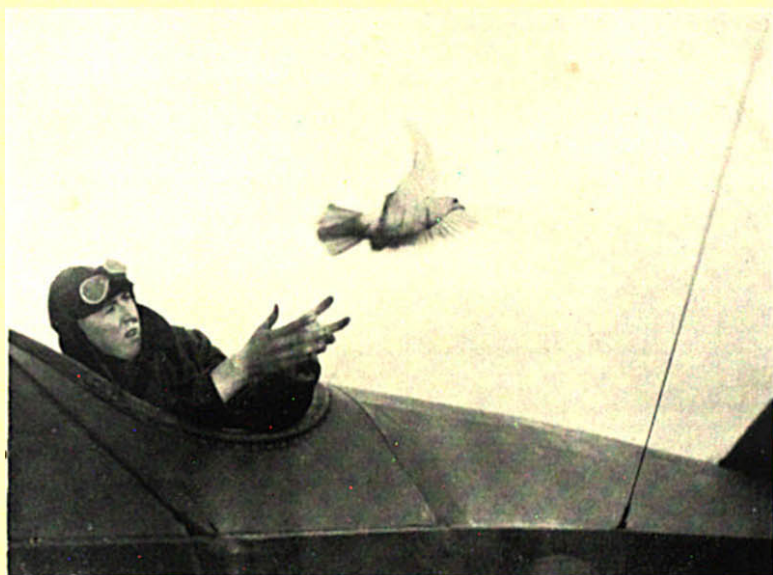
BRITISH AVIATOR RELEASING CARRIER PIGEON