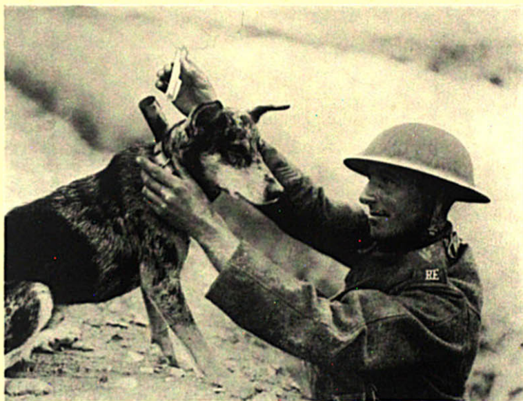
CAPTURE OF A GERMAN WAR DOG