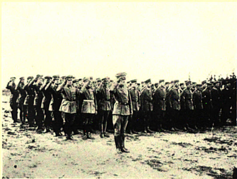
LAST PHOTO EVER TAKEN OF "THE RED KNIGHT OF GERMANY"